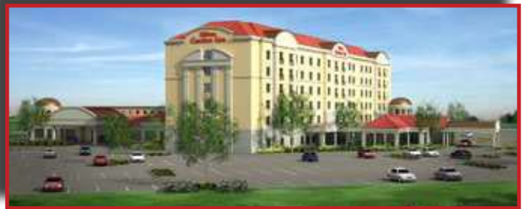
Hilton Garden Inn Dallas/Lewisville - Lewisville, Texas

Squadron/VLS Mastercon 1115 Crowley Drive • Carrollton, Texas 75006-1312