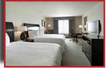
Guest Room (Double/Double)